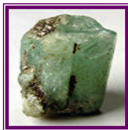
Emerald II – The High Priestess